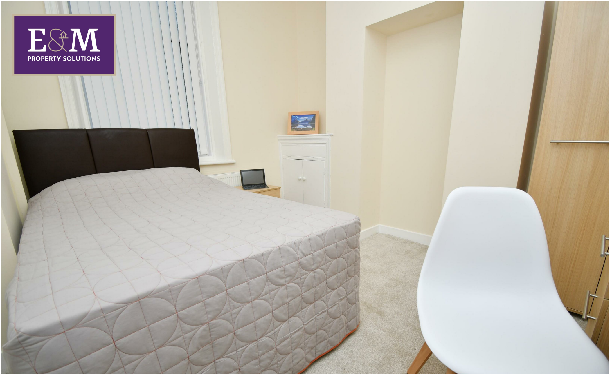
ROOM 4, 10 Prestwich Street, Burnley, Lancashire, BB11 4NZ £105 Per week